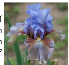
Cow Palace Burseen 2013

All of this stuff should explain “where Tom Burseen is at” nowadays!